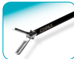
C-GRASP 18 mm jaw length