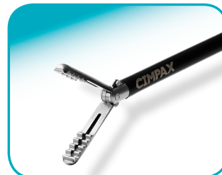
C-CLINCH 22 mm jaw length