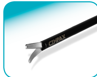
C-CUT 17 mm blade length