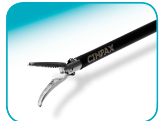
C-DISSECT 20 mm jaw length