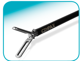
C-GRASP 22 mm jaw length