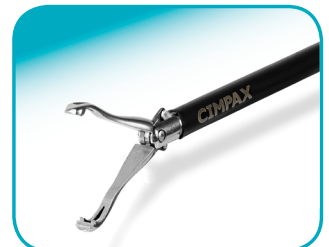
C-BAB 22 mm jaw length